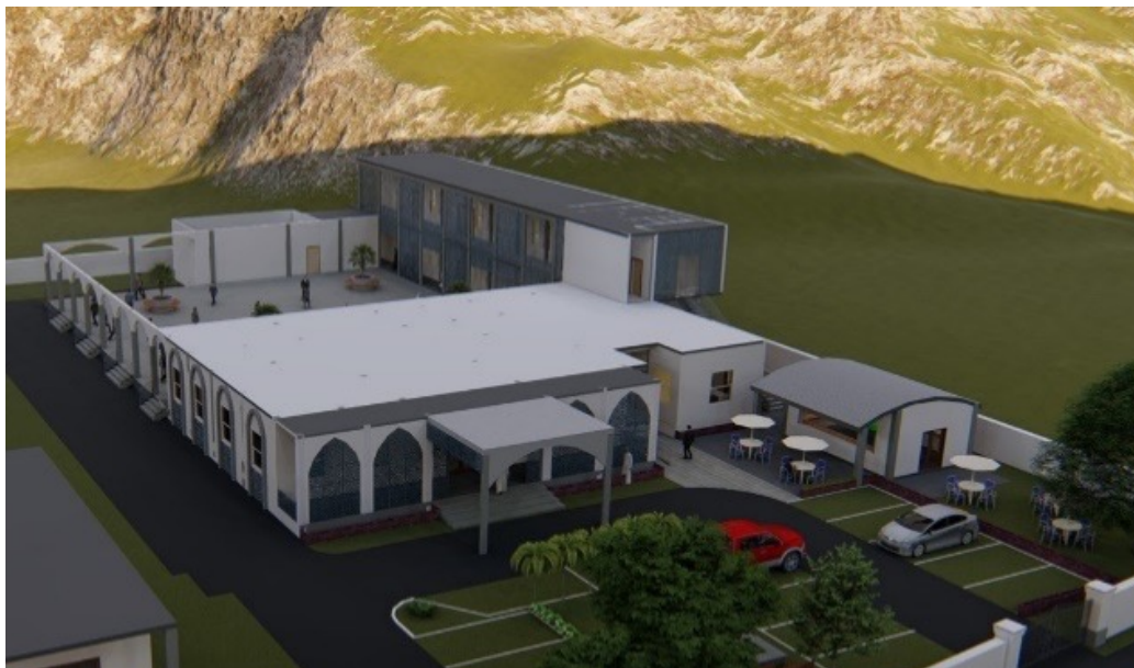
Phase 1 and Phase 2

Mais plus que jamais nous comptons sur votre générosité pour avancer. En sus des thawaab jaariyaa, in sha Allah, nous vous rappelons chers frères et chères sœurs que la Société Islamique des Mascareignes et de l'Océan Indien est une institution charitable approuvée par le ministère des finances et toute donation pourra être déductible de la taxe.